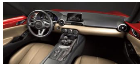
GT - Sport Tan with tan stitching